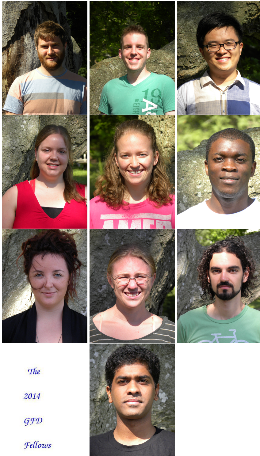
The 2014 GFD Fellows