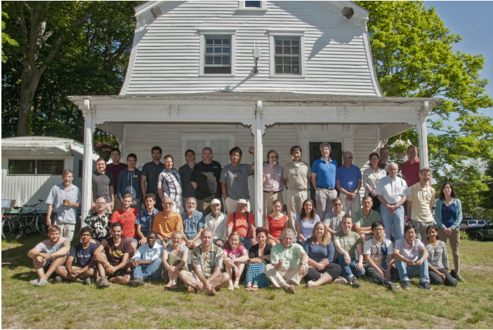
The 2014 GFD Photograph.