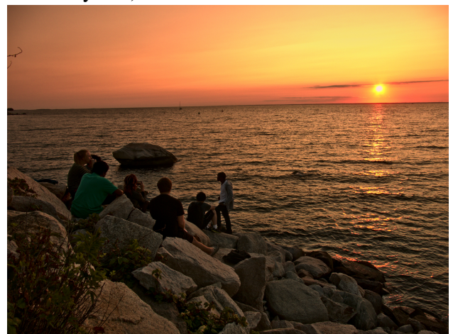
Knobska point with fellows.

the regular season. The fellows beat the staff 9 to 6 in four innings on the last Thursday of the program, despite the very experienced pitcher and catcher (average age = 89.5 years).