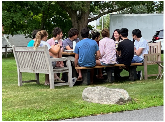
Left: Yearly Women of GFD lunch. Right: Fellows lunch with the speaker.