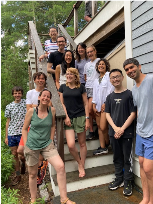
The fellows and the directors

As always, the focus for the faculty is the guidance of the GFD Fellows through their summer research projects. The fellows are strongly encouraged to work in areas unrelated to their PhD thesis topics and to engage with as many of the faculty and visitors as possible. The reward for all involved is the final week of the summer when the fellows give lectures on their projects, which are as widely varied as the fellows' backgrounds.