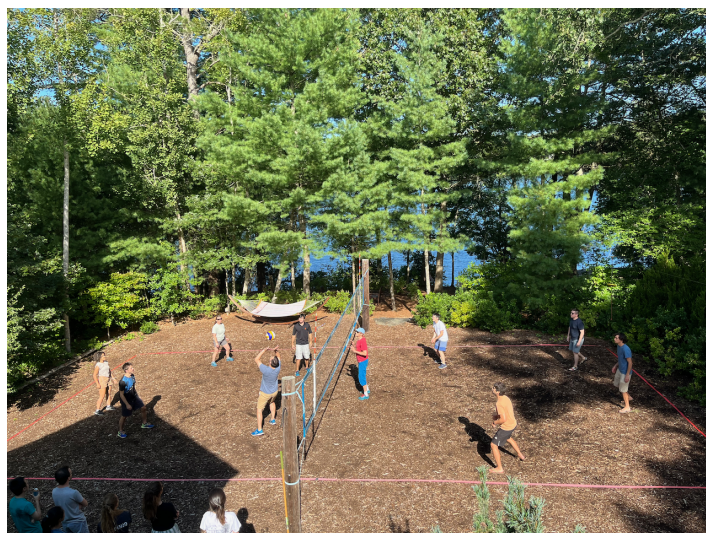
The staff vs. fellows volleyball game.