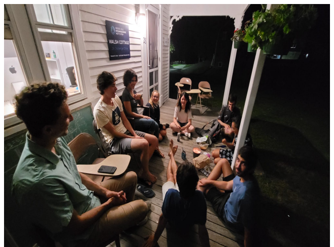
Daytime porch and night-time porch