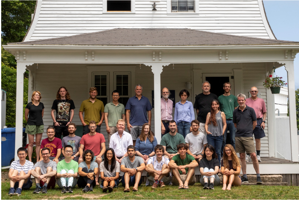
The 2023 GFD Photograph