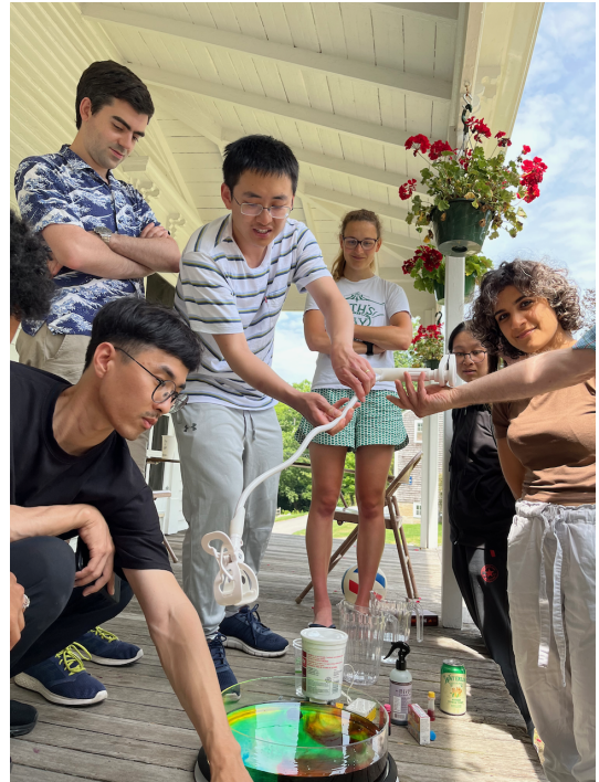
Fun with rotating fluids with DIYNamics.