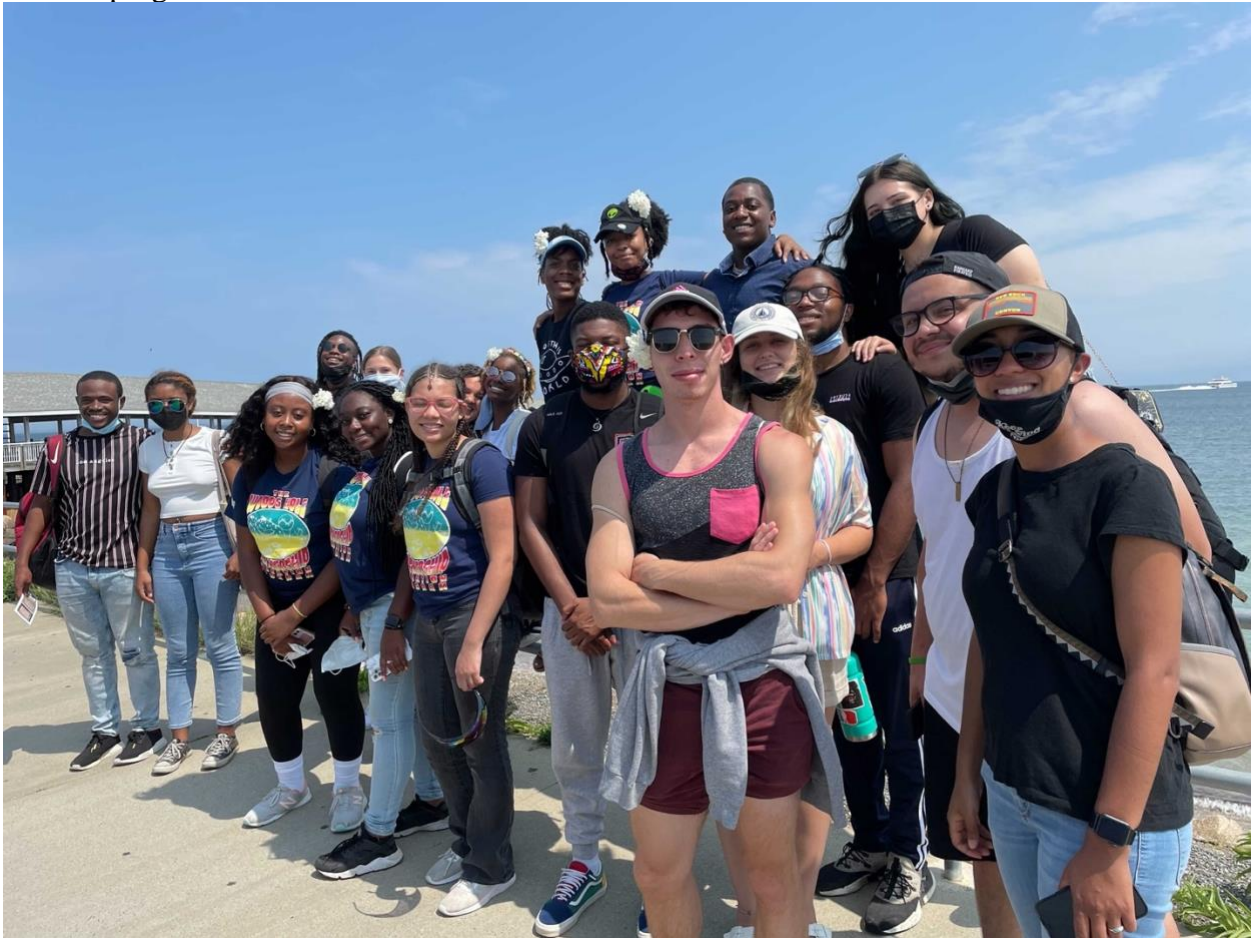
Figure 1: The 2021 PEP II Researchers, PEP students and PEP staff on Martha's Vineyard

encourage the interns and to ensure that the interns are having a productive experience in all elements of the program.