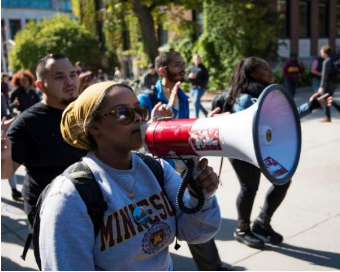
Campus Protest March against Hate speech

What is meant by “hate” on campus? The term “hate” can include several kinds of actions from bias incidents to crimes prosecuted by federal or state and local agencies.