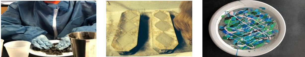
Figure. 2a) Mixing cement pastes; 2b) cement paste in molds; 2c) decorated cement paste frisbee

hammer and water absorption tests to determine the differences between their control and test samples. They also made and decorated control and test cement paste frisbees, which were weighed and thrown in a competition that occurred across an open outdoor space. Data collection and analysis involved throw distance measurement and a visual description of the state of the frisbee after it fell to the ground. Girls had to record and summarize the data in tables and charts for analysis and conclusions. Additional details on bio-char modified cement pastes are published in peer-reviewed journals [23-25].