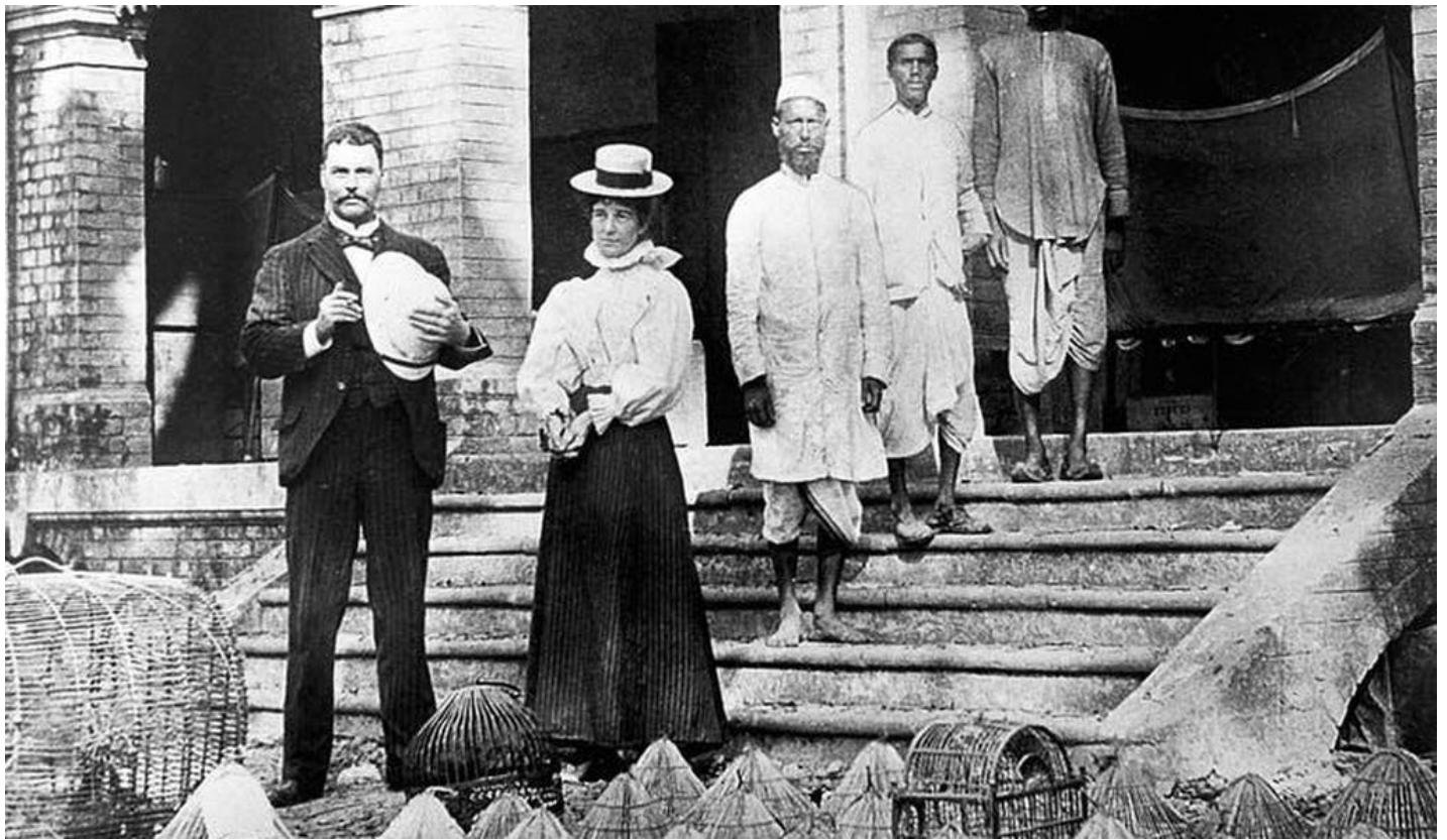
Ronald Ross at his lab in Calcutta, 1898.