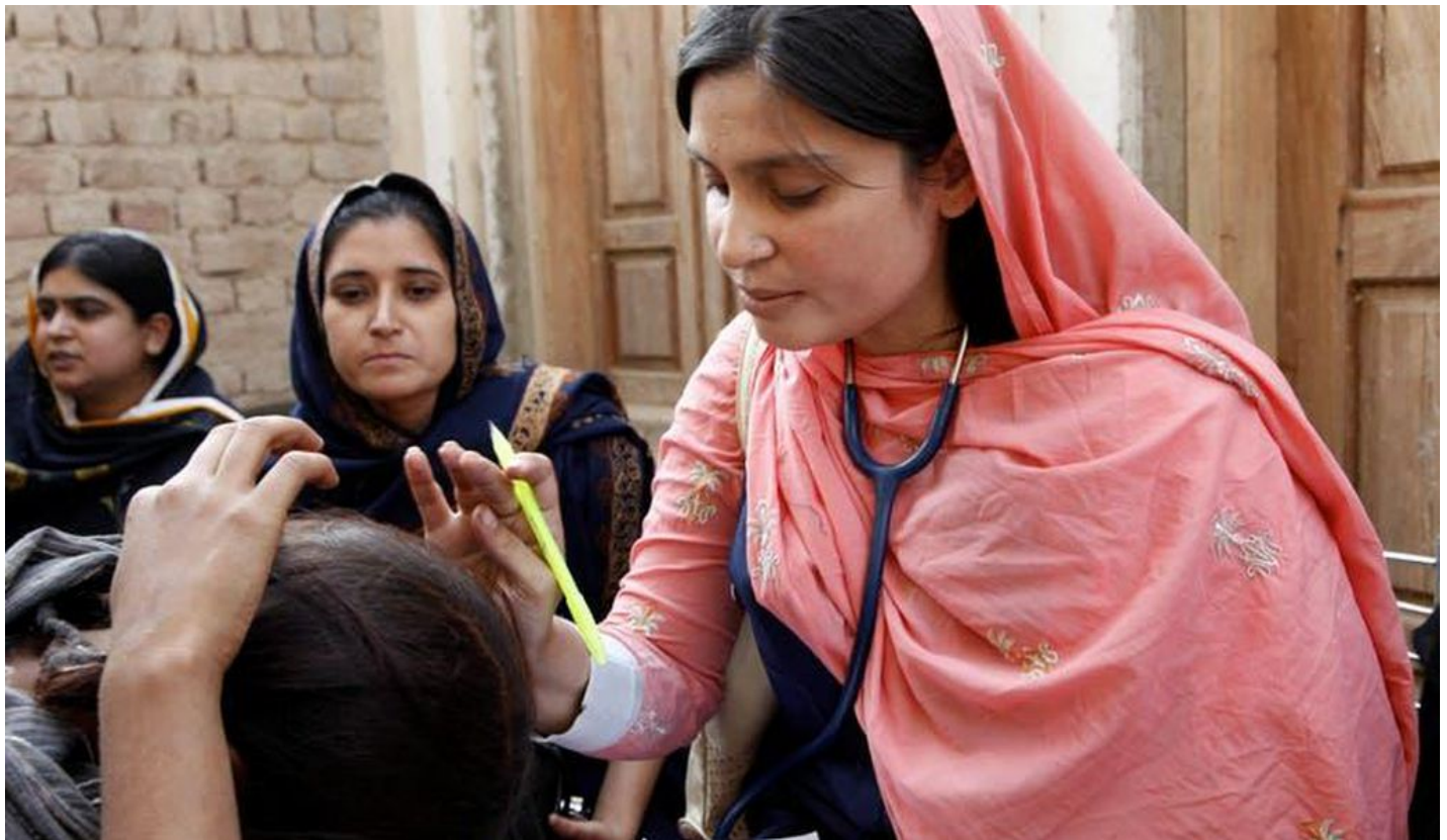
Polio eradication needs willing volunteers.