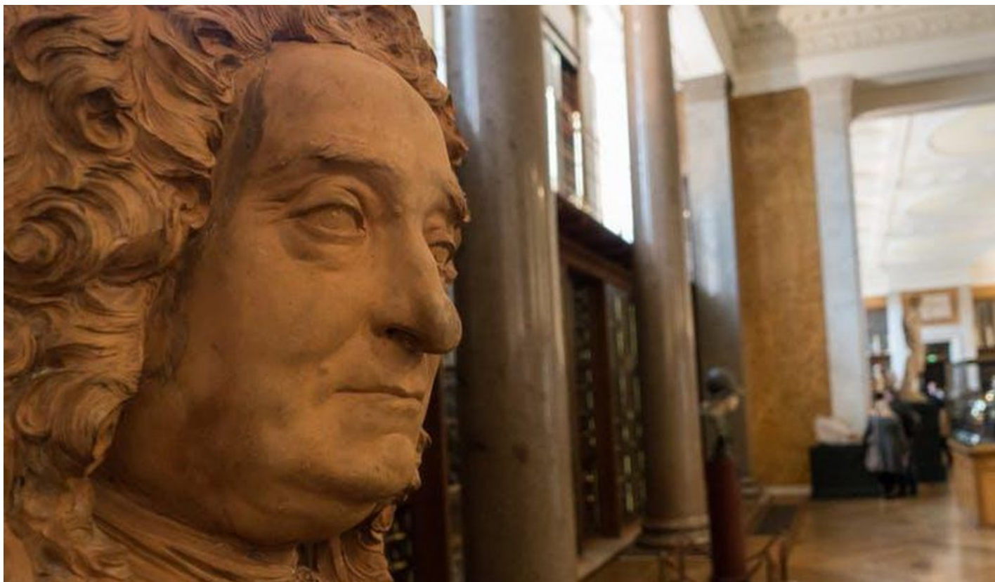
Sir Hans Sloane's imperial collection started the British Museum.