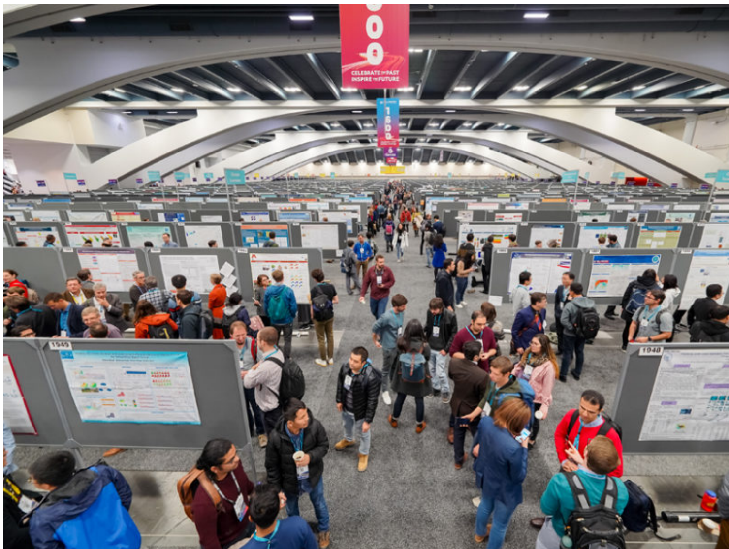
Poster Hall at AGU Fall Meeting.

Analyzing how people collaborate in AGU's meetings and publications according to gender, age, and ethnicity provides clear evidence for diversifying networks and collaborating with new people.