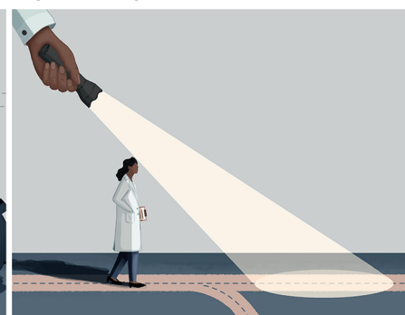
Figure 1. Pictorial representation of strategies to enable diversity and inclusion.

Minority scientists should identify and be paired with a senior colleague to champion their immediate and longterm career goals